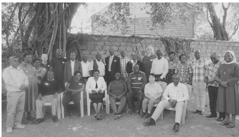
Director of the Asian Rural Institute and other staff visiting graduates and their Sending Bodies