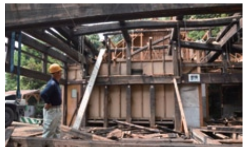
The wooden frame structure of the kominka during its dismantling in August

ARI's disaster reconstruction is far from over. With the demolition of the old Koinonia House, we lost the chapel, which has been central to our daily "Morning Gathering" time. For now, we hold these gatherings in the classroom, but the Chapel reconstruction project has finally started moving. The new chapel will reuse a type of traditional Japanese rural house, called kominka . We look forward to its completion in the summer of 2014. New staff houses and a butchering facility are also in the planning.