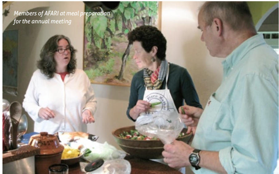
Members of AFARI at meal preparation for the annual meeting

peas, and other greens, donated from a local church garden, for the meals that were served. All food scraps from meal preparation went into compost. No leftover food was thrown out but eventually eaten. We carpoled religiously. The venue of our meeting was offered pro bono by one of our partners, the Episcopal Diocese of Olympia. Because of this level of intentionality, the total cost (aside from air fare) for a three day weekend of meetings, food and lodging for 10 board members, two spouses, and other volunteers came to less than $500.