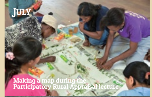
Making a map during the Participatory Rural Appraisal lecture