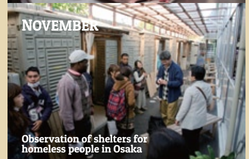
Observation of shelters for homeless people in Osaka