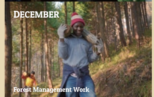
Forest Management Work