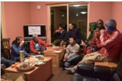
Party in the community room

At this time, we are especially thankful for the church organizations who