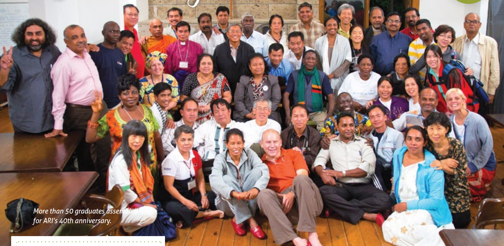
More than 50 graduates assembled for ARI's 40th anniversary.