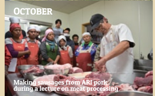
Making sausages from ARI pork during a lecture on meat processing