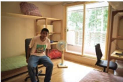
Inside one of the participants' rooms

After having spent the first couple of months of the 2013 training in a temporary accommodation nearby (the Nishinasuno Kindergarden "Activity House"), all male residents moved to their new home on July 28. The former dormitory was a rather crude two-storey ferroconcrete construction, built in the 1970s. The new dormitory has two separate buildings mainly made from wood. The rooms receive good sunshine and ventilation and floor heating is provided by solar panels. There is also a small kitchen as well as a community room for meetings and fellowship. The bigger dorm houses participants and volunteers, with two persons sharing one room. Staff members, couples and guests stay in the smaller dorm. Some of the new residents have praised this new dormitory as "paradise." Those who suffered through winter in the old dorm are green with envy!